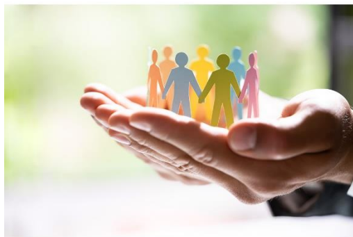
Image to Ponder:

How would the world change if we truly believed that God loved everyone?